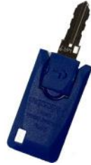
PL Laminate Master