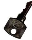
Metal Storage Master Key