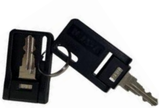
PL Laminate Standard Key Set