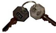
Metal Storage Standard Key Set