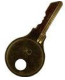
Metal Storage Core Change Key