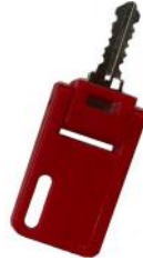
PL Laminate Core Removal